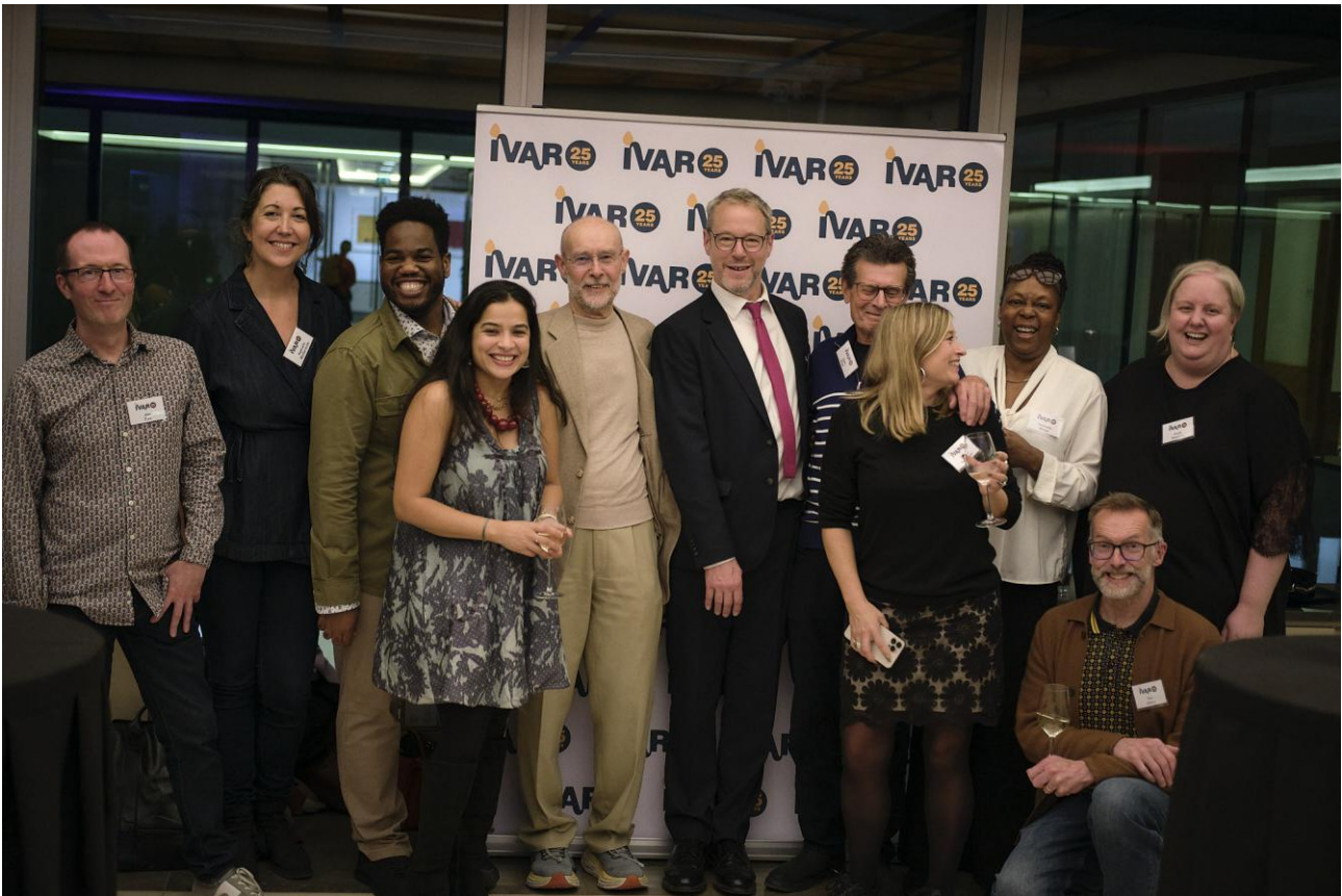
Some of our current and former trustees at IVAR's 25th birthday celebrations